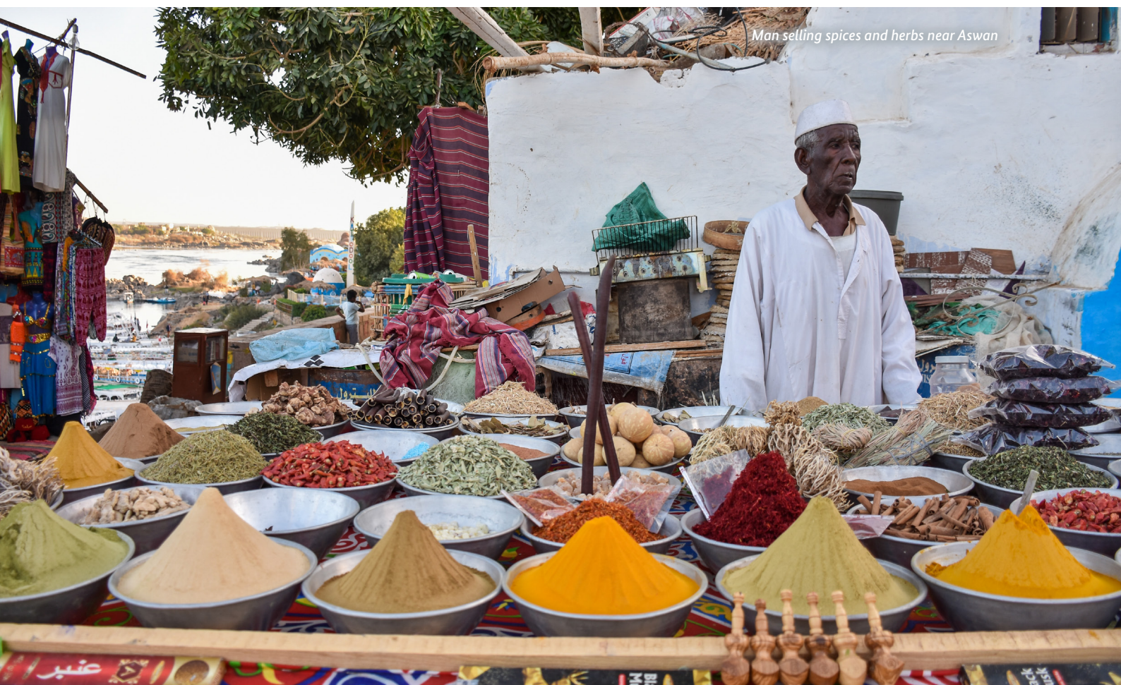
Man selling spices and herbs near Aswan

promoting the recycling of organic matter. It sets the target to convert 20% of land to sustainable agriculture by 2030 including 350,000 ha of land dedicated to organic agriculture, signifying a threefold increase in comparison to today. Reaching these goals could be achieved in the so-called new land with the reclamation of the desert provided access to water supply can be guaranteed sustainably and investors are found.