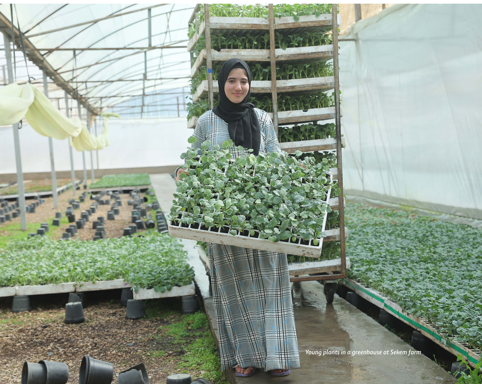
Young plants in a greenhouse at Sekem farm

the single most important buyer. A large share of Sekem's products are produced for the local market using new commercialisation techniques such as basket schemes or cooking events with organically grown food and specialty varieties. Sekem spearheads innovative private sector projects to cultivate the desert (e.g. Bahareya, Minya or Wahat for 2,000 ha) organically and to create new agriculture land with diversified products. This contributes to a sustainable production and to the satisfaction of the market demand and creates environmental and social benefits.