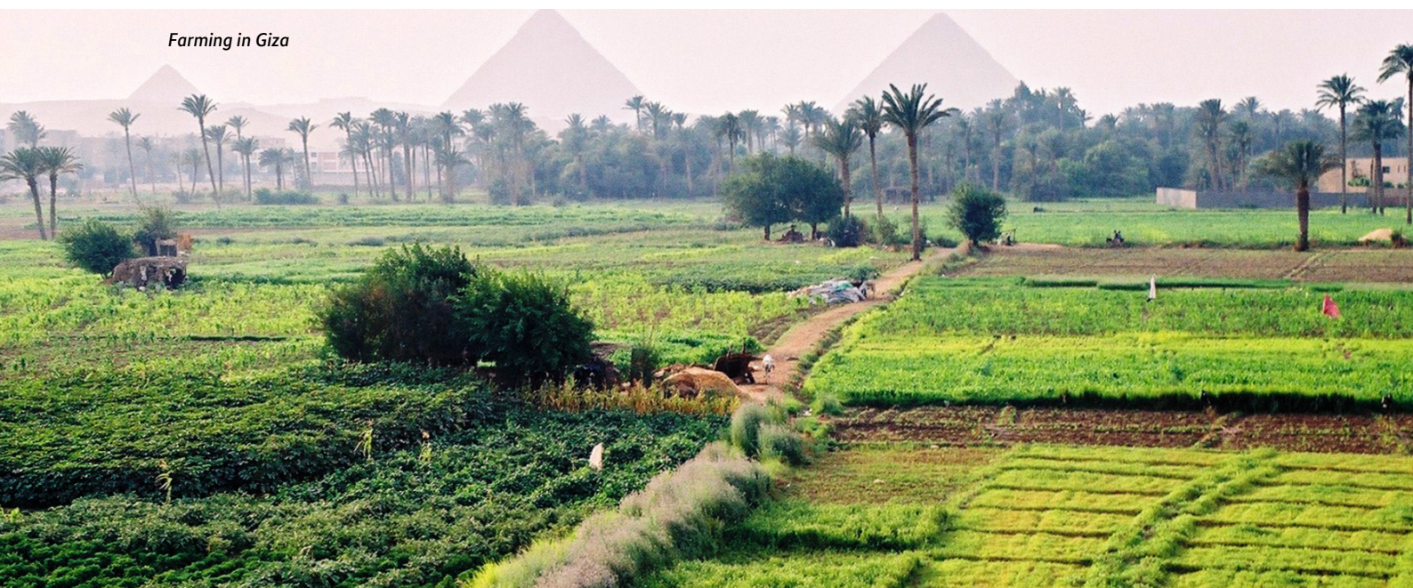
Farming in Giza