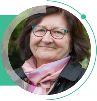
By Uygun Aksoy ETO-Turkey